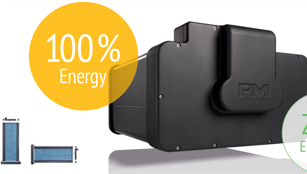
Grafik/Foto: High-performance stack with bi-polar plates. Unique installation horizontally and vertically possible and worldwide only available with Proton Motor.