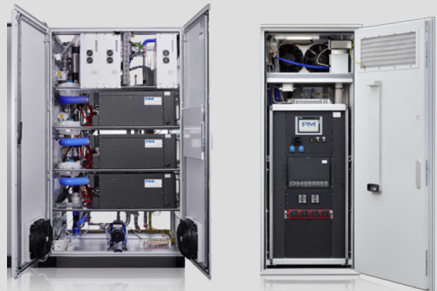
Examples of stationary applications equipped with the PM Module S5 / S8

The heart of the Proton Motor technology is the stack module, which is adapted to the power range. It is specially developed and manufactured by Proton Motor. In addition to the stack module, the fuel cell system already contains supply units for hydrogen and reaction air and a primary cooling circuit. The fuel cell system has a modular structure and can be interconnected to achieve higher performance. It is flexible and adaptable to multiple applications as well as reliable and predictable thanks to PM's all-round services. Individual customer applications and exclusive system requests can be fulfilled.